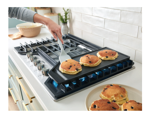
2-IN-1 HINGED GRATE TO GRIDDLE

Enjoy more mealtime possibilities by easily swapping between cooking surfaces with our industry-first interlocking 2-in-1 Hinged Grate to Griddle. The hinged design also allows for easy cleaning. (available on 75 step-up series)